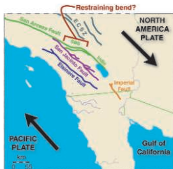
Map of the San Andreas (green) and San Jacinto (purple) faults.

The southernmost segment of the San Andreas fault extends from the Salton Sea, bends around the San Bernardino and San Gabriel mountains, and intersects with the San Jacinto